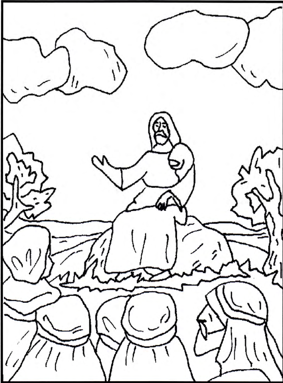
The Sermon on the Plain Luke 6:17-26